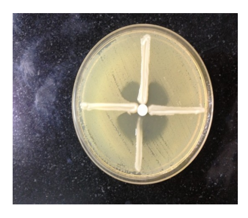
1a) Modified Hodge test-Positive clover leaf pattern

Fig.1 Detection of carbapenamase by MHT and Combined imipenem- EDTA disk test